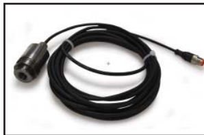
Hydraulic Transducer PN 131211