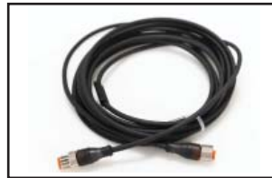
Homerun Cable PN 131228

Compatibility note: The Loadrunner Roll-Off System is sized to replace the hinge pivot of Roll-Off hoist models produced by Galbreath, GalFab, Accurate, Ruddco and other Roll-Off manufacturers.