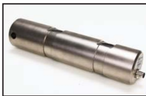
Roll-Off Load Pin PN 131204