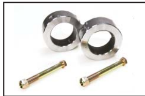
Roll-Off Assembly Kit PN 153104