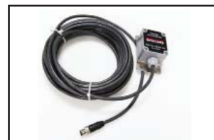
Onboard Inclinometer PN 131222