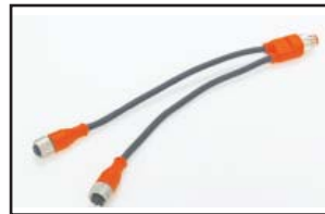
Y-Splitter Cable PN 131226