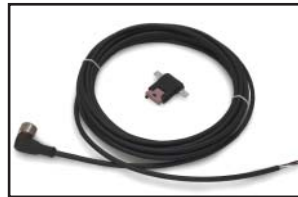
Power Cable PN 131221