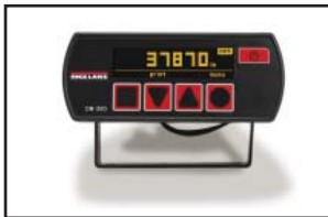
OB-350 Indicator PN 131219