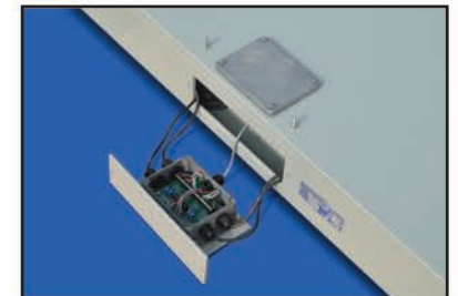
Easy access to side mounted polycarbonate NEMA 4x junction box.