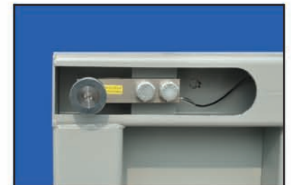
Self checking captive ball leveling feet.