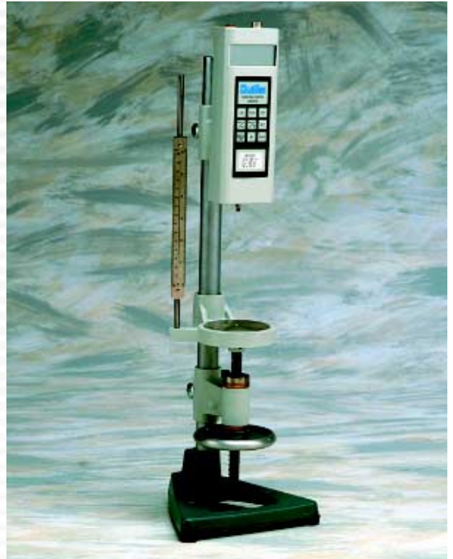
LTC shown with DFGS digital force gauge

SPECIFICATION SS-FM-3121-1200 December 2000